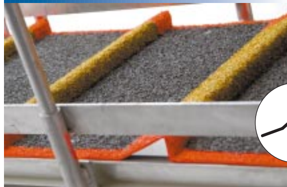
STEPPED GANGWAY TREAD Serial No GW1

e-mail: sales@scotgrip.com website: www.scotgrip.com