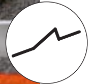
BAR GANGWAY TREAD Serial No GW2