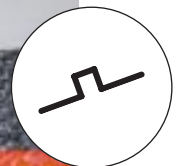
ELLIPTICAL GANGWAY TREAD Serial No GW3